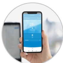
WiFi Connection for remote monitoring