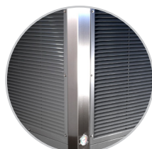
Anticorrosion stainless steel structure