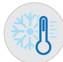
Large operating range up to -15°C