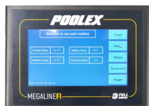
Large color display control panel