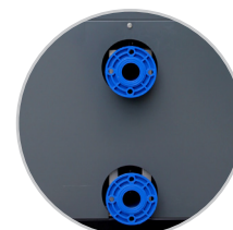
Large connections for professional swimming pools